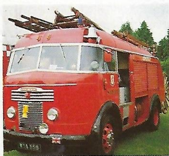
17. 1956 COMMER QX/ALFRED MILES, Wre Reg. No. WYA 559