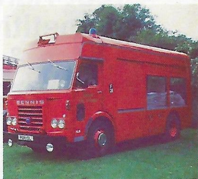
35. 1973 DENNIS F108 HOSELAYER Reg. No. PGN 15L Fitted with the Perkins V.8. AU510 engine.