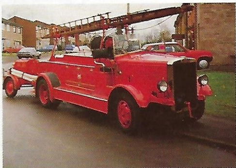
3. 1937 LEYLAND FK6 CUB Reg. No. CUR 151 with a 1939 BERRESFORD STORK trailer pumping unit.