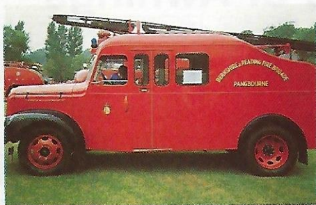
14. 1954 MORRIS COMMERCIAL/WADHAMS HtT/PCV. Reg. No. GRX 41