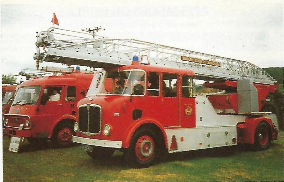
23. 1962 AEC MERCURY/MERRYWEATHER TLP Reg. No. 8126 FD