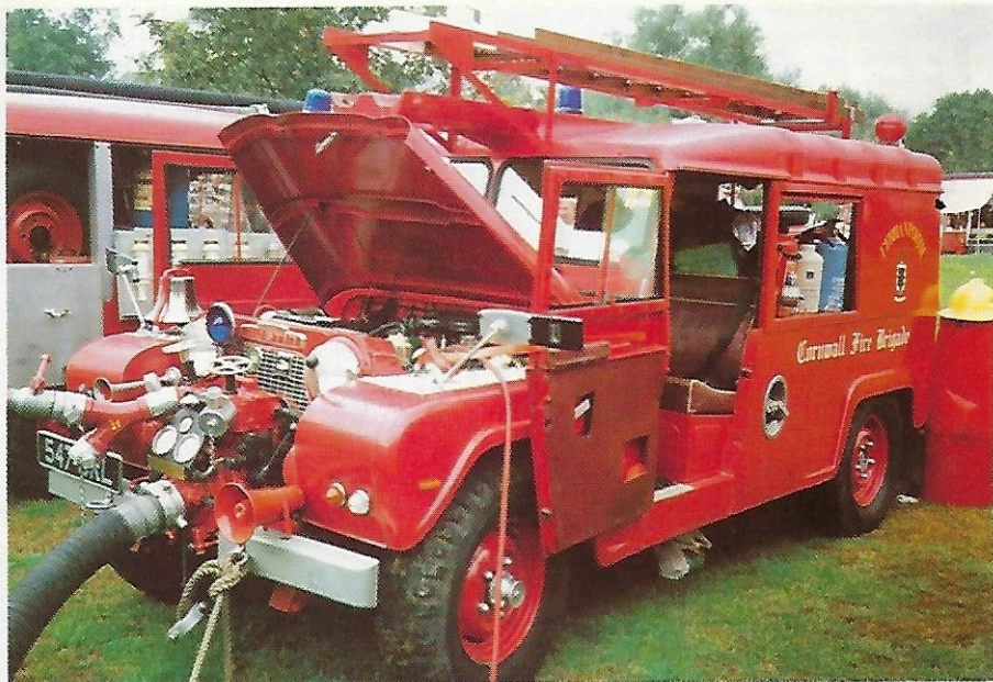
28. 1964 AUSTIN GYPSY L4P with front mounted Coventry Climax pump. Reg. No. 547 URL.