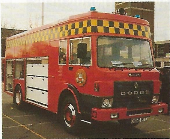
38. 1986 DODGE/SAXON C.I.U. Reg. No. D952 ETC