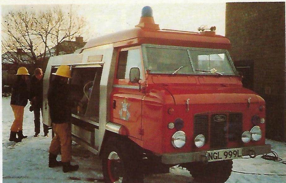
37. 1973 LANDROVER Rest Reg. No. NGL 999L A 'Forward Control' Landrover