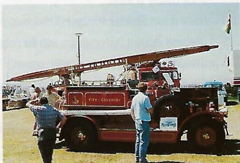
Reg.No. DU 179